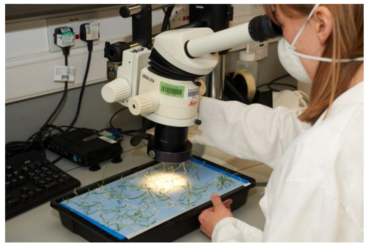
Figure 2. Visual examination of blotter trays under a dissecting microscope.