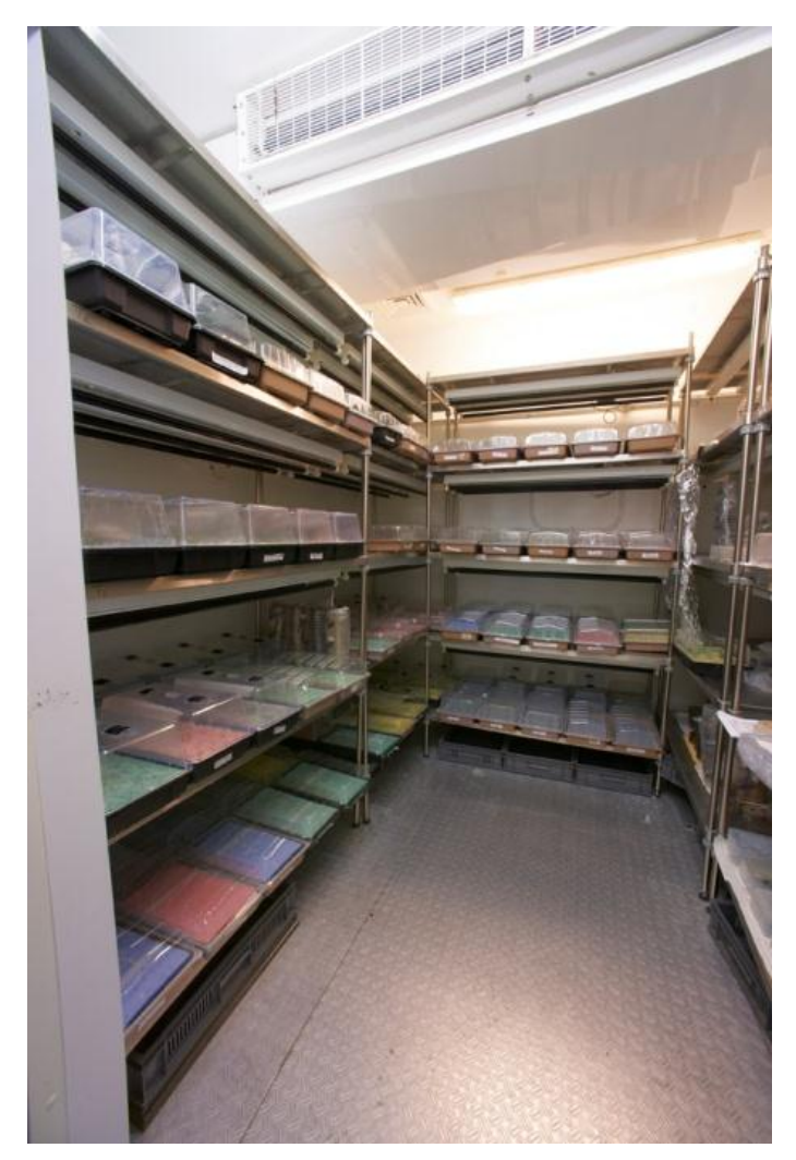
Figure 1. Blotter trays in large incubation room.